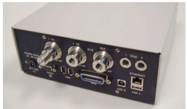
PACE1000 from the rear